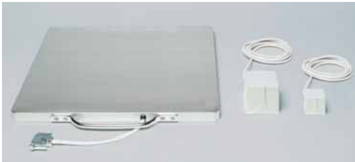
Multiple transmitter options enable use in medical environments once unsuitable for magnetic tracking.