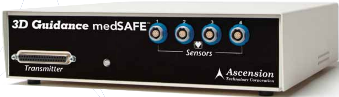
Electronics unit with multiple sensor and transmitter options